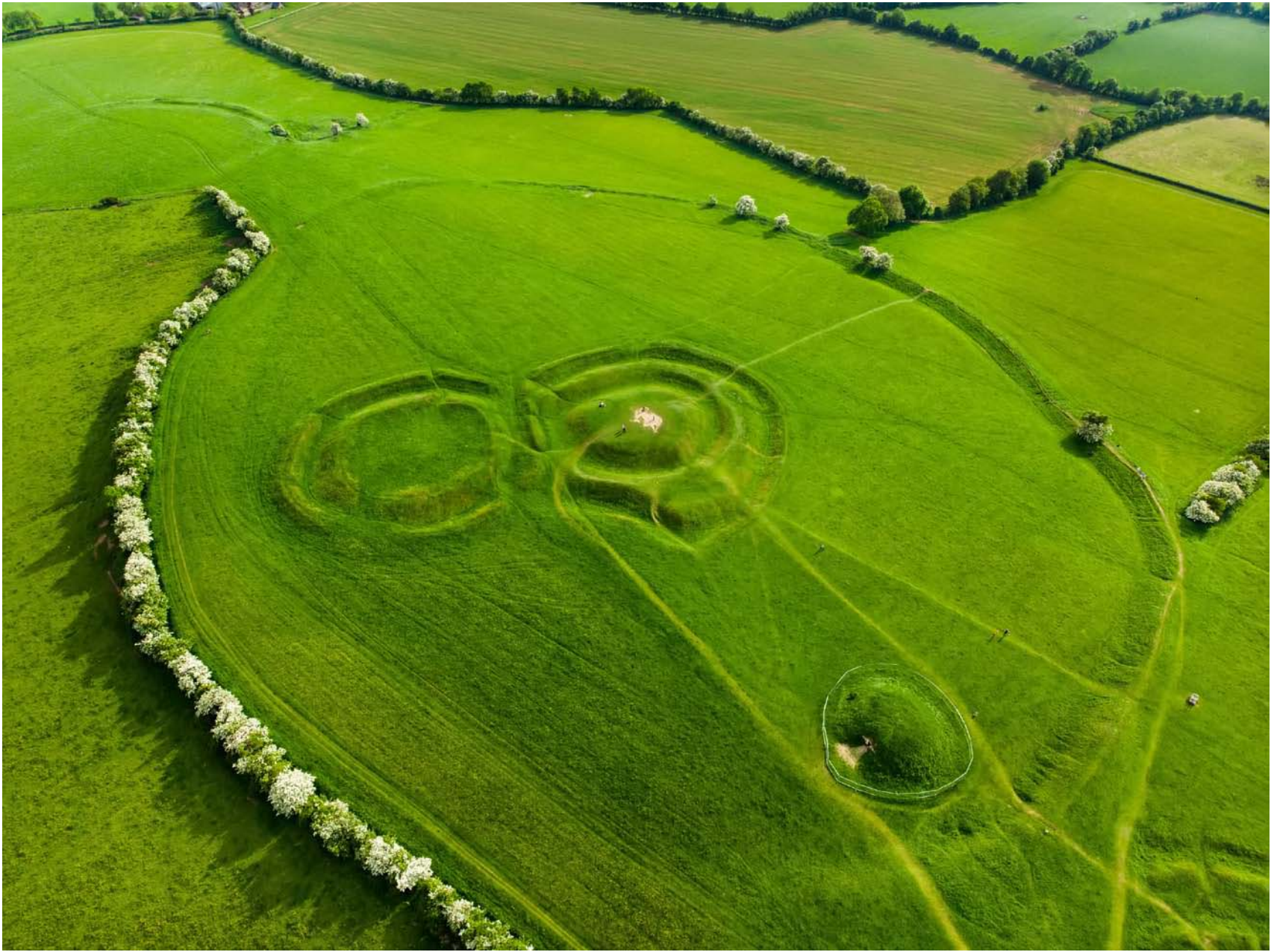
The Hill of Tara