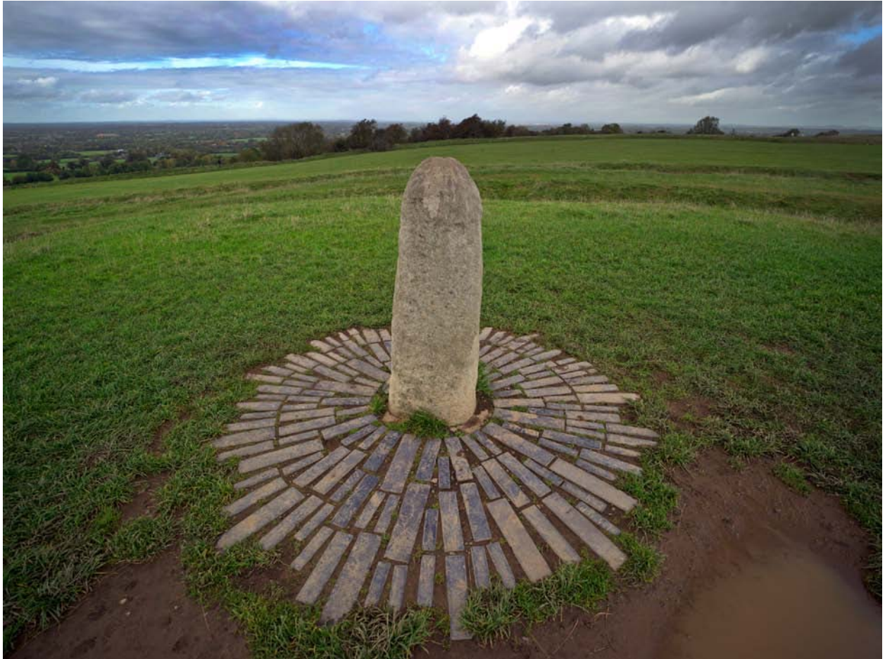
“Lia Fáil” on Hill of Tara