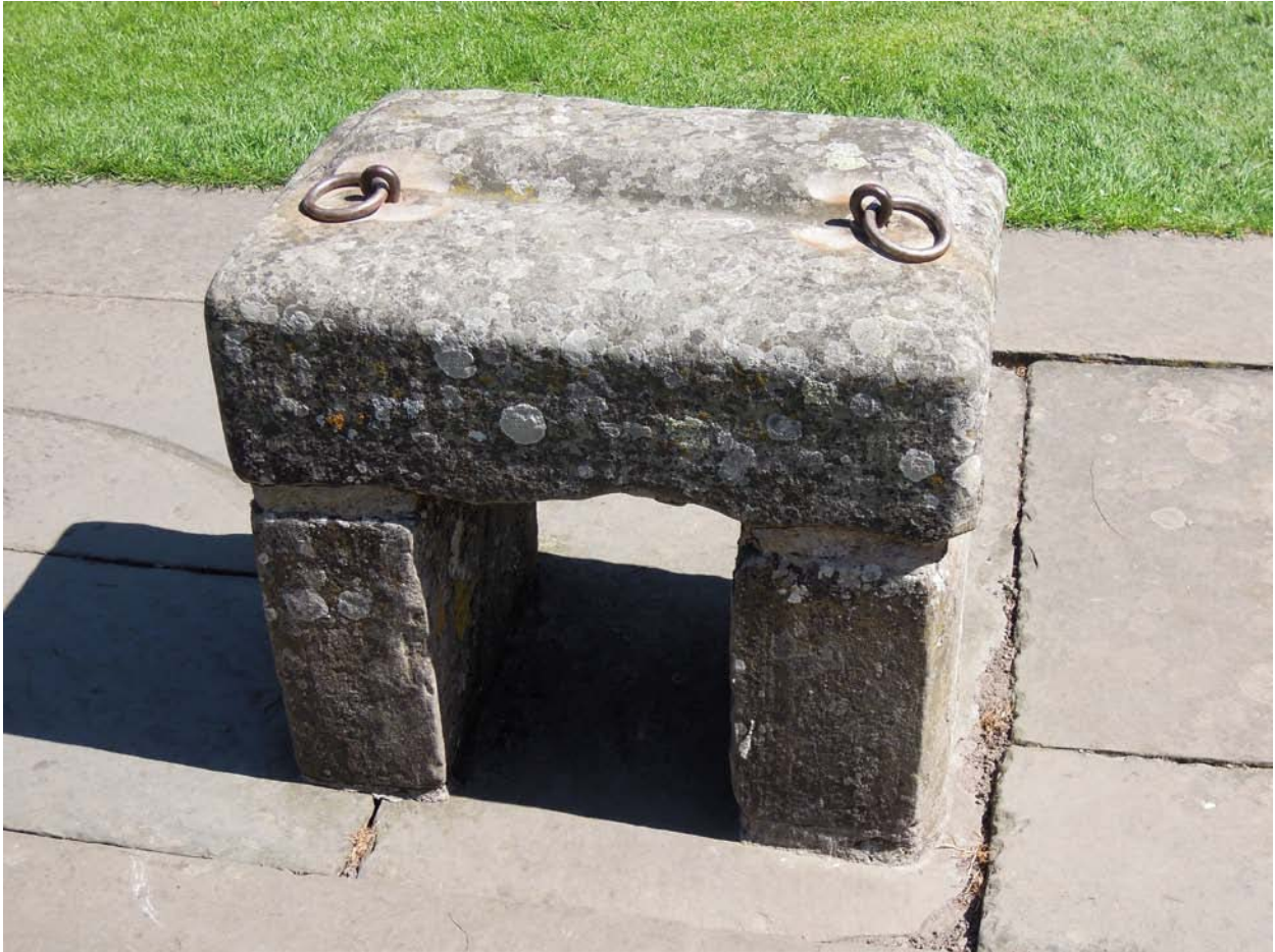
Stone of Scone, replica on the grounds of Scone Palace, near Perth, Scotland